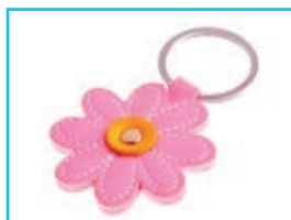
a key ring