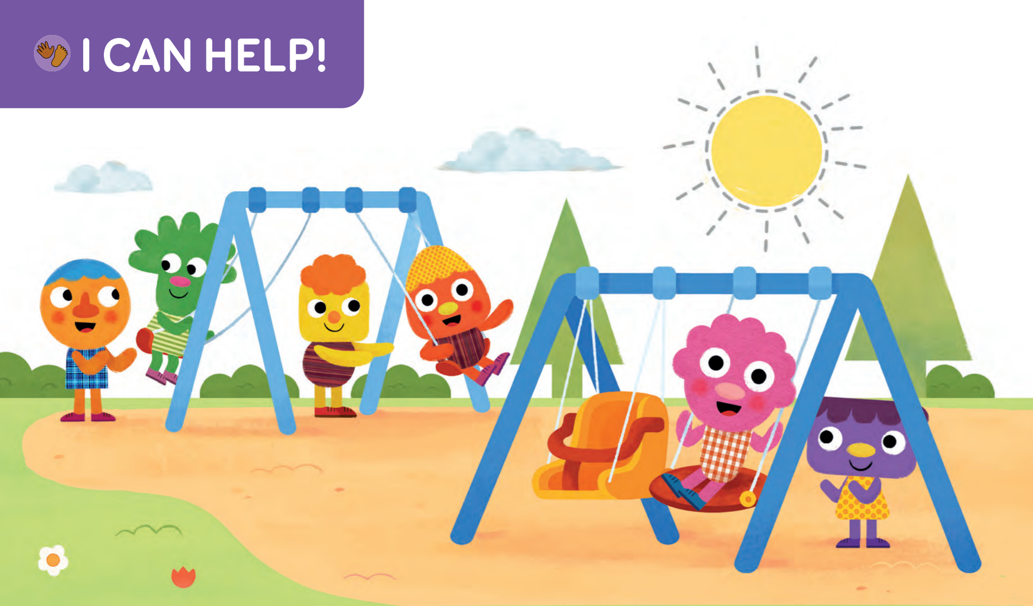
NOODLE AND HIS FRIENDS ARE IN THE PLAYGROUND.